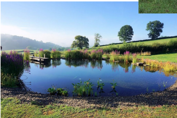
Time to think and reflect