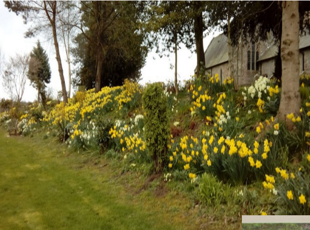
Spring in Llantilio

The parish magazine of Llantilio Crossenny, Llanvetherine, Llanvapley and Penrhos