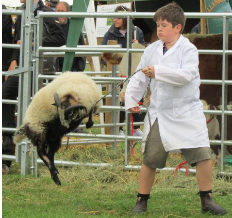
It's show time at Usk

The Parish Magazine of Llantilio Crossenny, Llanvetherine, Llanvapley and Penrhos