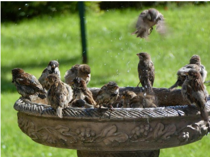
and it's bath time in Llantilio