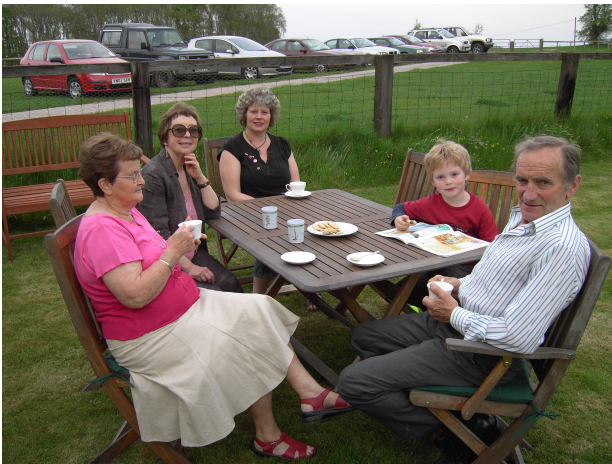
People enjoying the Coffee Evening