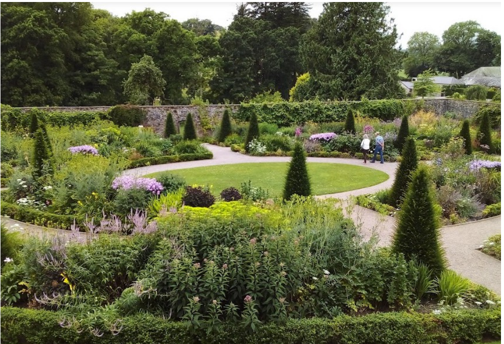
A typical member's garden!