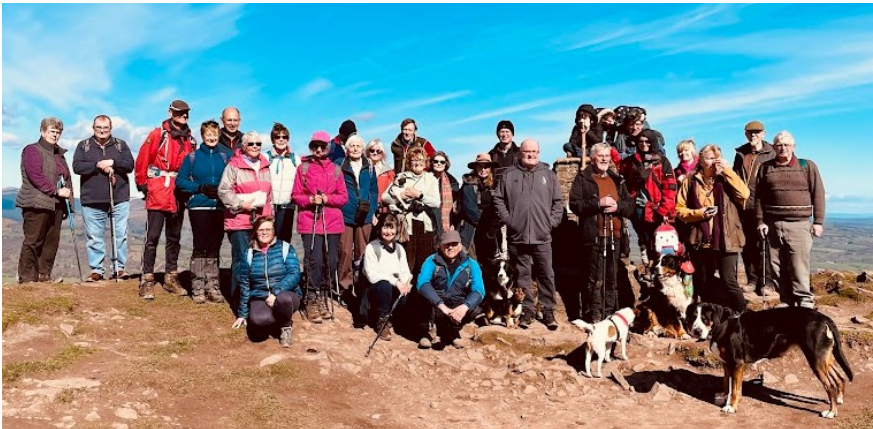
while others reach the end of their journey