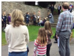
Find out what happened when Timmy met Martha!

October 2015 The parish magazine of Penrhos, Llanvapley, Llantillo Crossenny and Llanvetherine