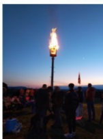
and beacons were also popping up everywhere!