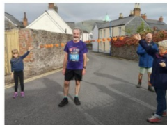
and Phil celebrates supporting Abergavenny Town of Sanctuary