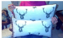
Find out who won these wonderful home made cushions in the Christmas draw in January!