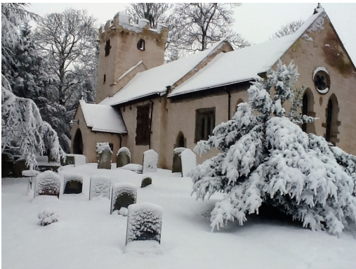
Llanvapley Church covered in snow in 2010

You can find out more about our churches on our website www.llantiliogroup.info We are also on Twitter @LlantilioG