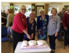
Find out who made the cake

August 2019 The Parish Magazine of Llantillo Crossenny, Llanvetherine, Llanvapley and Penrhos