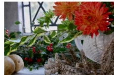
Llantillo Church celebrates the harvest of 2021

November 2021 The Parish Magazine of Llantillo Crossenny, Llanvetherine, Llanvapley and Penrhos