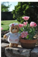
Thanks to all our key workers and to everyone who has stayed at home, clapped for carers and put out their teddy bears and rainbows to make us all smile!