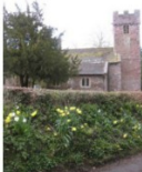
Springtime at Penrhos Church

PENRHOS LLANTILLO CROSSENNY LLANVETHERINE LLANVAPLEY