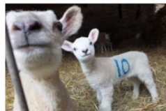
Find out why number 10 is smiling

February 2018 The Parish Magazine of Llantillo Crossenny, Llanvetherine, Llanvapley and Penrhos